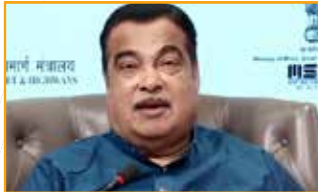
Hon'ble Shri Nitin Gadkari, Hon'ble Minister of Road Transport & Highways Ministry of Road Transport & Highways