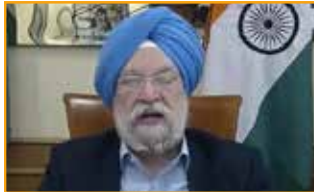
Hon'ble Shri Hardeep Singh Puri Hon'ble Minister of State for Housing and Urban Affairs, Govt of India