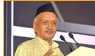
H.E. Shri Bhagat Singh Koshyari Former Governor of Maharashtra