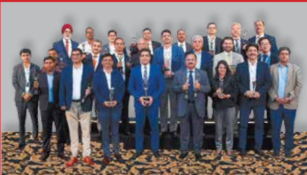
EQUIPMENT INDIA AWARDS