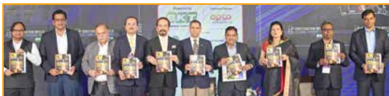
Construction World Global Awards