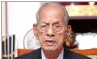
Dr. E. Sreedharan 'Metro Man of India' Padma Vibhushan