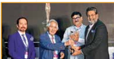
Construction World Architect & Builder Awards