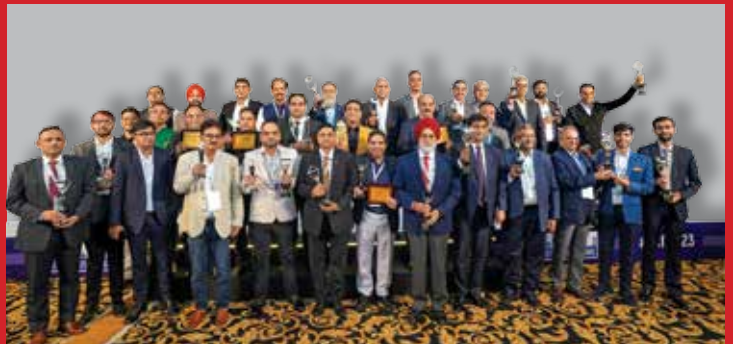
CONSTRUCTION WORLD GLOBAL AWARDS